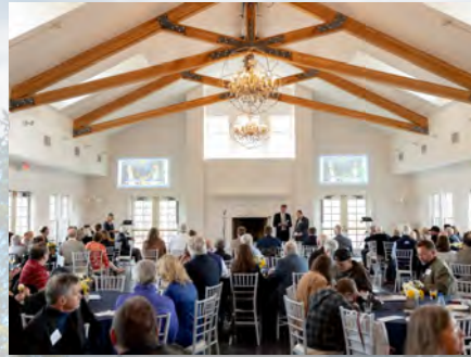
50th Celebration at The Manor House

You can view our 50th Anniversary video which celebrates both our history and our future at www.ccu.org/about/our-story .